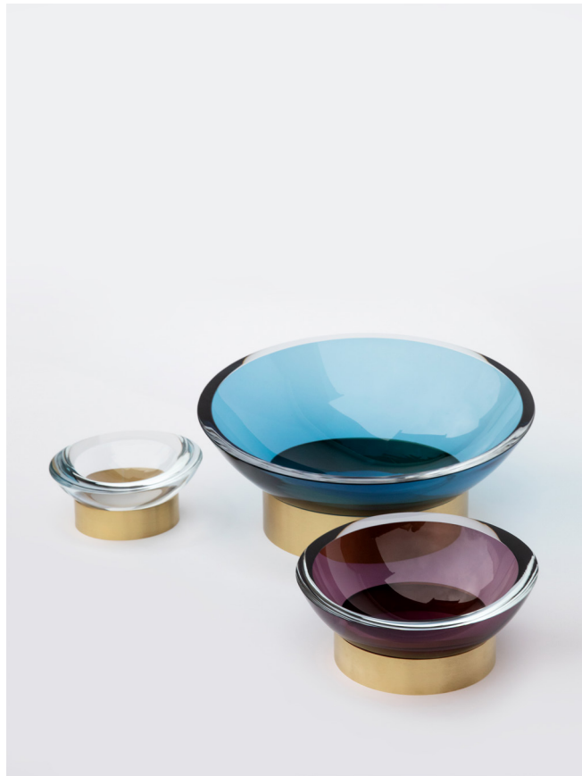
From left: Small/Clear, Large/Steel Blue, Medium/Plum on Brushed Brass rings