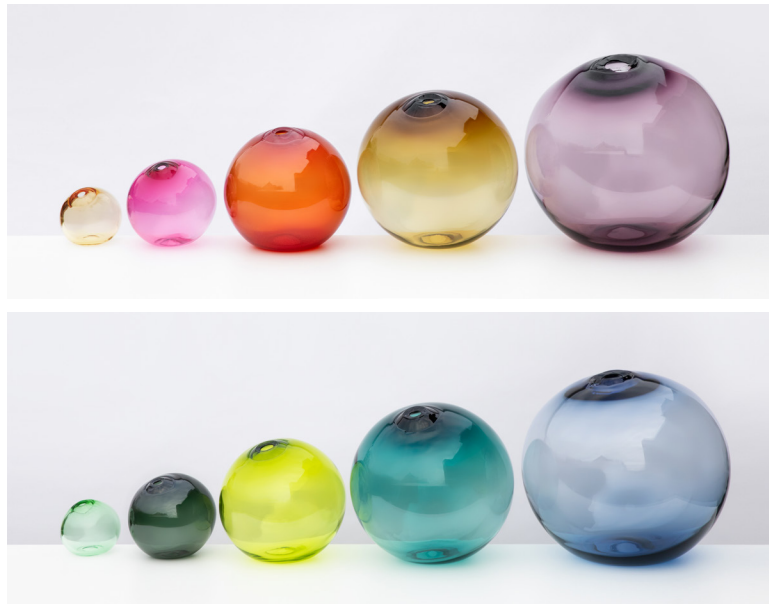
Top, from left: 6" Whiskey, 8" Fuchsia, 12" Strawberry, 16" Sargasso, 20" Plum Bottom, from left: 6" Light Green, 8" Smoke, 12" Lime, 16" Pine Tree Green, 20" Steel Blue