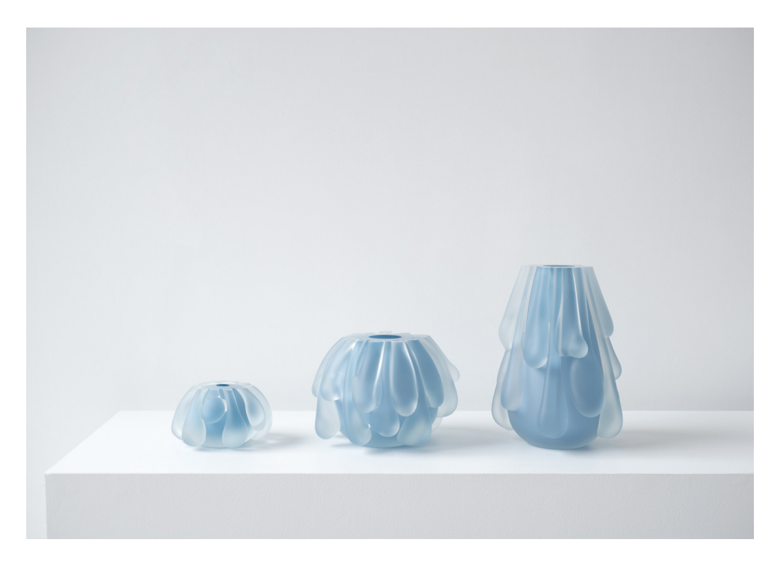
From left: Small Round, Round, and Tall