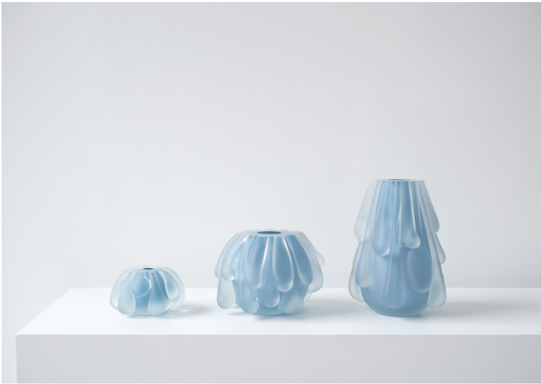
From left: Small Round, Round, and Tall