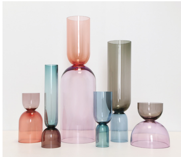
From left: Shape 1, Shape 4, Shape 3, Shape 5, Shape 2 and Shape 6